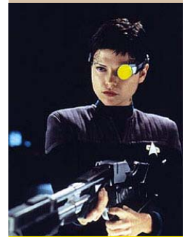
Ezri Dax tracks down a sniper in “Field of Fire.”