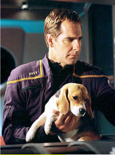
Captain Archer and Porthos

Copyright 2003 U.S.S. Chesapeake NCC-9102, a not-for-profit organization. All rights reserved, including reproducing parts of this document.