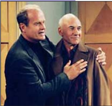
Patrick Stewart (right) reunites with Kelsey Grammer in Frasier.