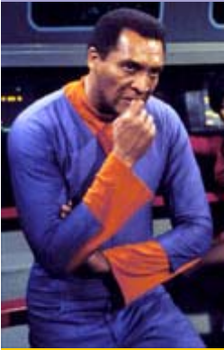
William Marshall as Doctor Richard Daystrom