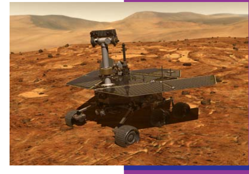
A NASA illustration of the Mars rover, Spirit.

ART CREDITS: startrek.com 1, 2, 4 marsrovers.jpl.nasa.gov