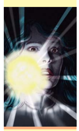
The cover to an upcoming Star Trek: S.C.E. novel.