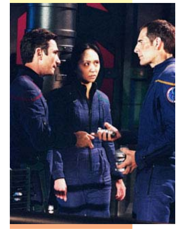
Reed, Hoshi and Archer infiltrate the Xindi weapon in the Enterprise episode, "Zero Hour."