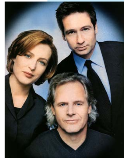
Gillian Anderson, David Duchovny and Chris Carter from The X-Files .