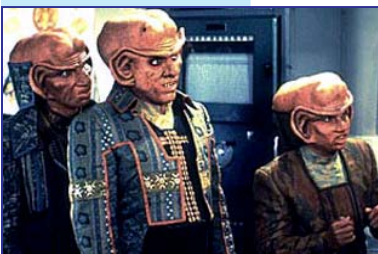
Rom, Quark and Nog in Deep Space Nine ’s “Little Green Men.”