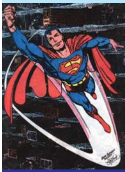
A John Byrne pin-up of Superman.