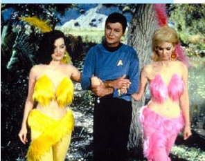
Doctor McCoy enjoys “Shore Leave.”