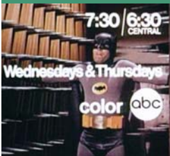
"Same Bat-time, same Bat-channel!"