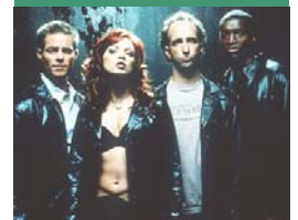
The series cast for the last season of Sci Fi Channel's First Wave