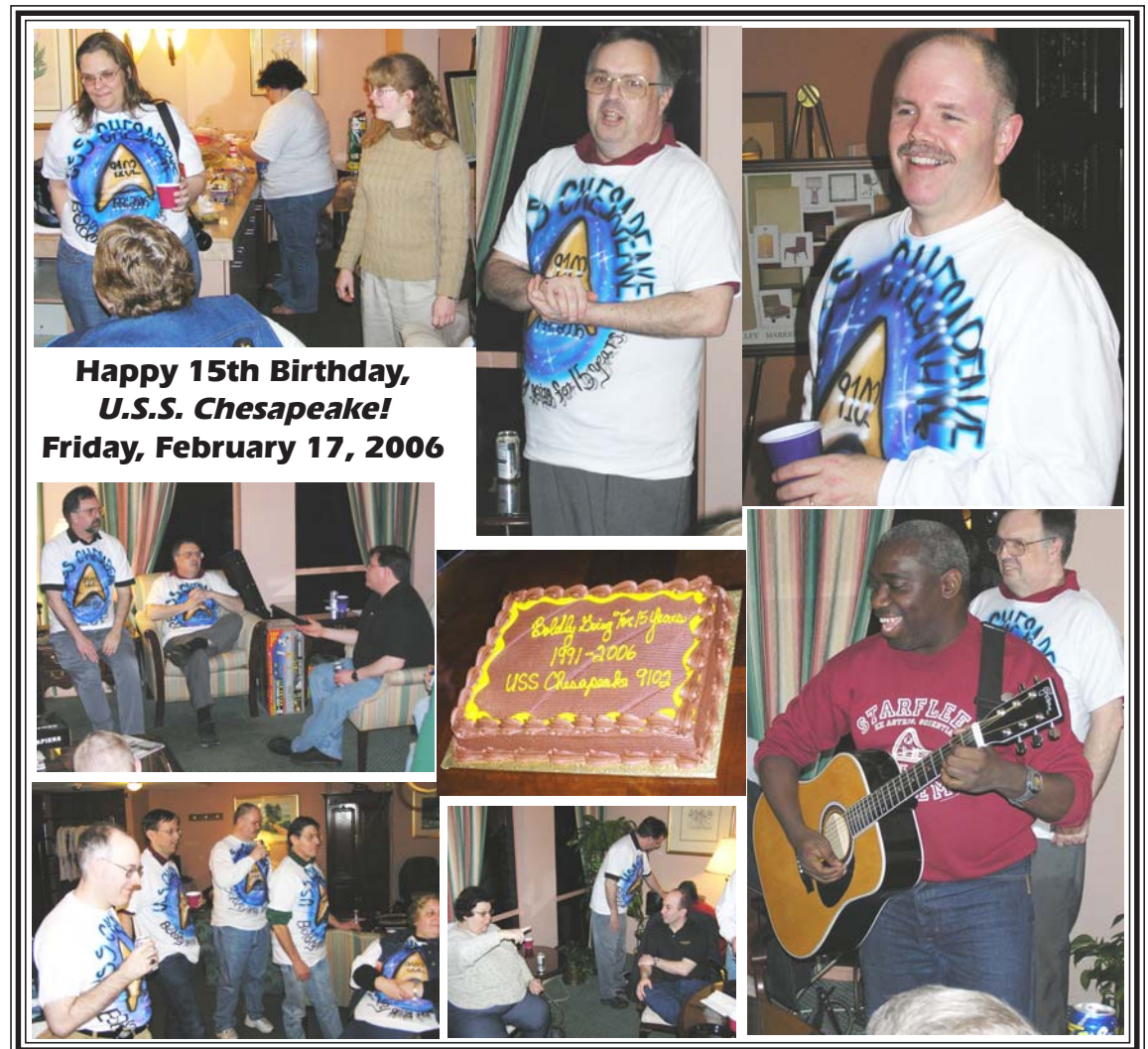
Happy 15th Birthday, U.S.S. Chesapeake! Friday, February 17, 2006