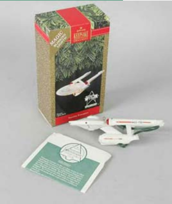
The Enterprise Hallmark ornament released in 1991.

Copyright 2006 U.S.S. Chesapeake NCC-9102, a not-for-profit organization.