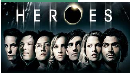
Some of the cast of the new NBC show Heroes .