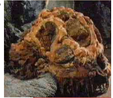
The Horta from Star Trek's "Devil in the Dark."