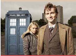
From left, the TARDIS, Billie Piper as Rose Tyler, and David Tennant as the Doctor from Doctor Who .