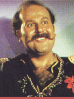
Lovable rogue Harcourt Fenton Mudd as he appeared in Classic Trek .