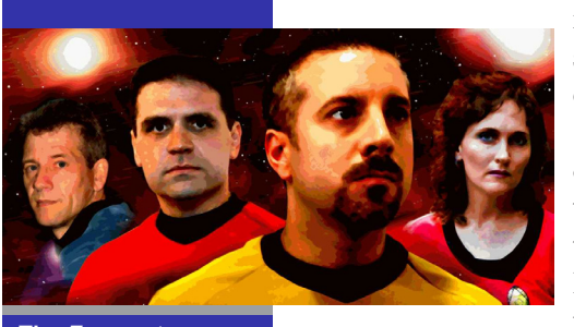
The Farragut crew has appeared in their first episode.

Copyright 2007 U.S.S. Chesapeake NCC-9102, a not-for-profit organization. All rights reserved, including reproducing parts of this document.