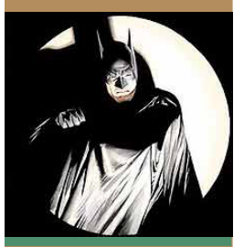
Another Batman illustration by Alex Ross.