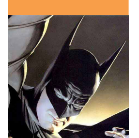
Another Batman illustration by Alex Ross.