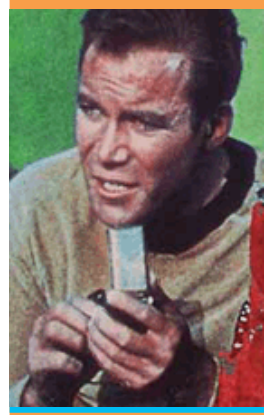
Captain Kirk talks to his ship via his communicator.

ART CREDITS: startrek.com 1, 2, 3 images.google.com 4 alexross.com 5, 6 sheldoncomics.com 6 scifi.com Insert front W&R Graphics Insert back