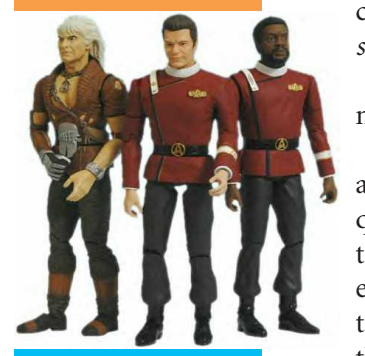
It just "figures" that Khan would eventually invade Trek 's celebrations!

Copyright 2007 U.S.S. Chesapeake NCC-9102, a not-for-profit organization. All rights reserved, including reproducing parts of this document.