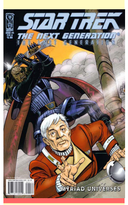
Sulu and Worf fight to the death in "Star Trek: The Next Generation: The Last Generation"

Copyright 2009 U.S.S. Chesapeake NCC-9102, a not-for-profit organization. All rights reserved, including reproducing parts of this document.