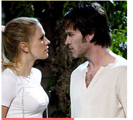
It doesn't happen often, but here Sookie (left) sees eye to eye with her vampire lover Bill on True Blood .