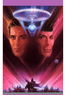
Star Trek V: The Final Frontier