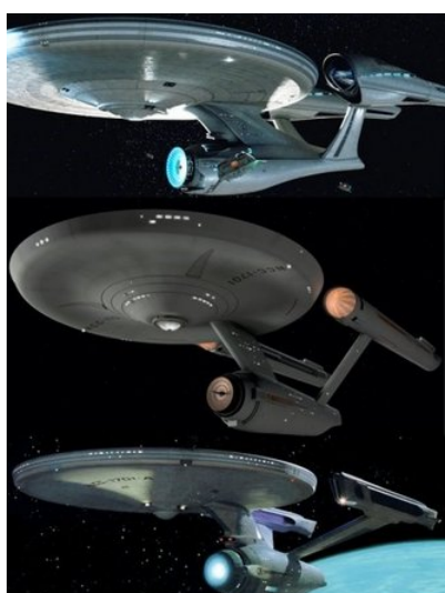
And a ship named Enterprise

"Star Trek," "Star Trek: The Next Generation," 'Star Trek: Deep Space Nine," "Star Trek: Voyager," and "Star Trek: Enterprise," as well as the terms "starship" and "starship Enterprise," are registered trademarks of Paramount Pic tures Corporation. All rights reserved. Absolutely no infringement on these rights is intended.