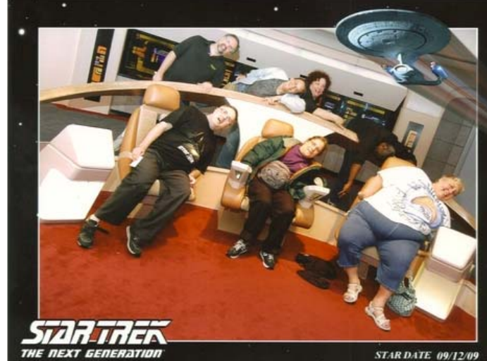
Crew members react as the Next Gen bridge set rolls to port (above)