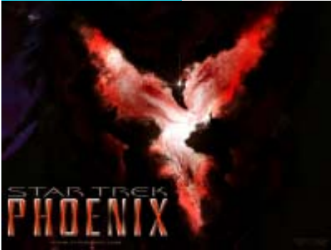
Star Trek: Phoenix Rises