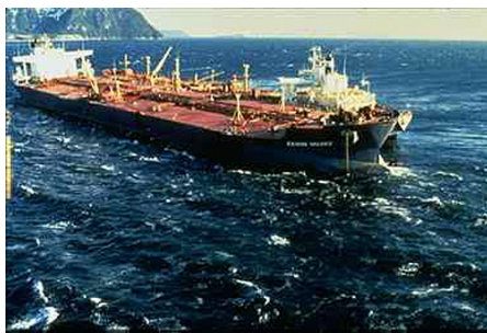
Now which one is the good metaphor and which one is long forgotten?

http://www.cnn.com/2010/US/06/18/ gulf.oil.bp.partner/