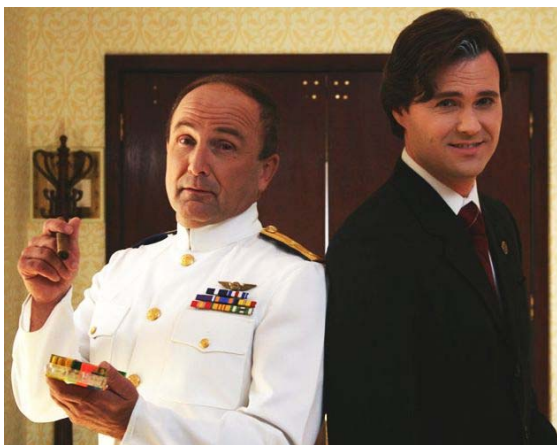
Al and Sam...now how can Sam look so much younger after all these years...I never understand time travel

When Al appears to Sam in an embassy holding area, he says that rescuing Diana is not the reason Beckett's there. Instead, his objective is to mend relations between Meredith and her father. However, the president has signed an order telling Beckett to rescue the princess if he can.