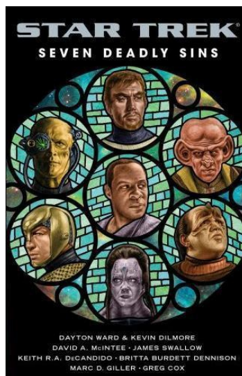
Let's see...the Borg's obvious, but which sin is Sisko?

Kein's new commanding officer, Dal Enkoa, soon demonstrates the "Peter Principle" of being promoted to his level of incompetence and his own ambition gets the best of him. In spite of