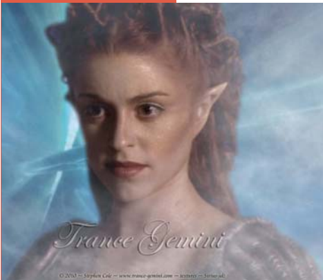
Ms. Trance Gemini

Starfleet Intelligence Officer Annie White