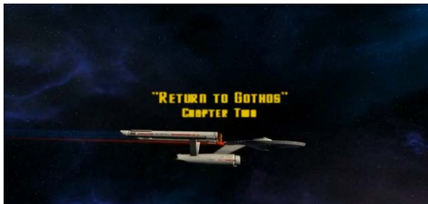
Opening shot for the above titled Episode of Star Trek: The Machinima Series

Good thing you can't see my jellyfish Clint Eastwood hat. It's all gooey and sticky. Yuk.