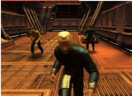
Sneaky Animated Characters