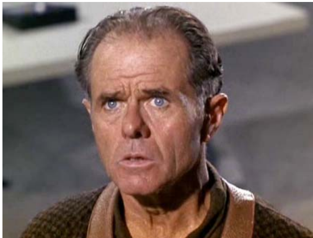
Ever wonder why Kirk only had two sets of clothes? Cogley’s retainer wiped out his whole salary. All those paternity suits, you know.