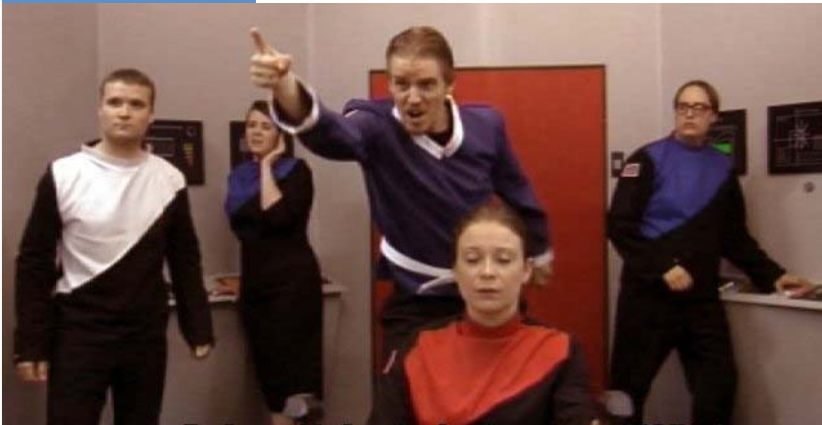
From left: Knight, Darling, Davenport and Jenkins look on as Logan gives the

lon space is because the aliens are on the verge of completing a weapon capable of destroying Earth.