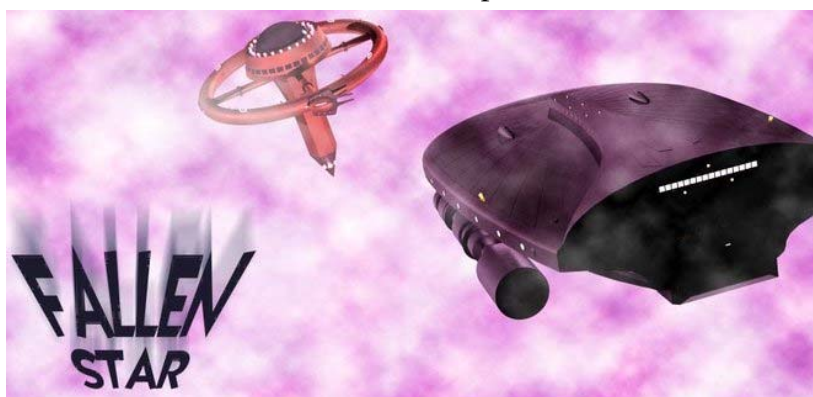
The H.M.S. Britannic approaches an enemy space station. [ed. What's with the pink nebula?]