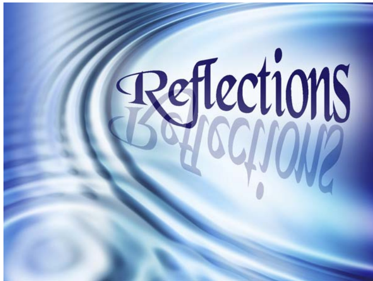
I'm lazy, what's your excuse?

Well, the first thing I always do is separate the Fantasy from the Science Fiction. Folks who know me know I'm not a big fan of Fantasy. I need a foot in reality to be interested and Fantasy doesn't do that for me, for the most