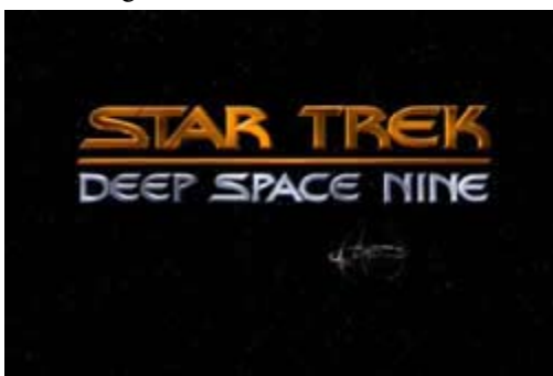
Can't you just hear the theme music?

Premiering on January 3, 1993, DS9 quickly became what TV Guide called "the best acted, written, produced and altogether finest" Star Trek series. But you're here for the science and technology angle, aren't you (if you weren't you'd already be reading that Refractions column)? So, here you are: