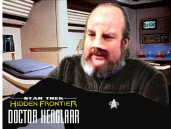
Can You Spot the Pink Nebula?