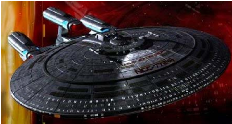
Three Nacelles? Now that's original.