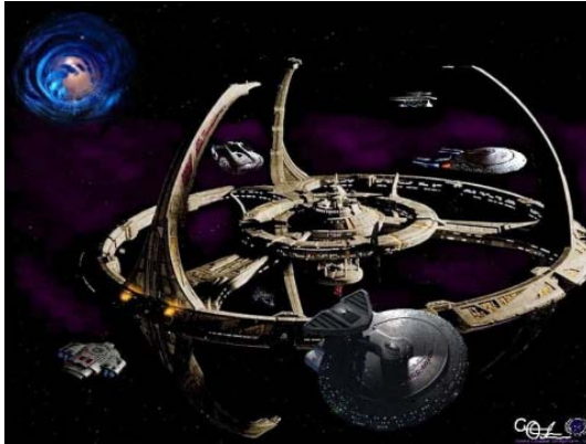
I know you know which episode this is.

Here's my prediction: My plan was to list 18 moments in science and technology from DS9 's seven seasons. We got through 14 in part I of this column, meaning we only have four to go. I'm placing a bet against all takers that I won't be able to stop at just four. This is Deep Space Nine after all. Let's get started.