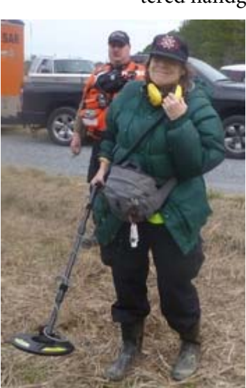
Xenobiologist Pat McCoy of the U.S.S. Chesapeake beams down to Delmarva to take part in a S&R Mission

The first thing we encountered was the Continued on page 5