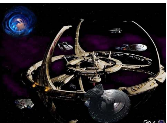
I know you know which episode this is.

Quick Thoughts on Science and Technology in Deep Space Nine