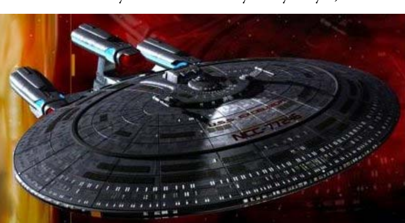
Three Nacelles? Now that's original.

As the U.S.S. Excelsior patrols along the Briar Patch, a plasma conduit blows out above Deck 32. The only person in the area is Crewman