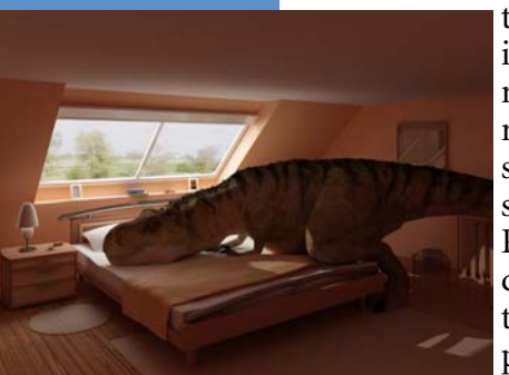
The cute female neighbor from upstairs?