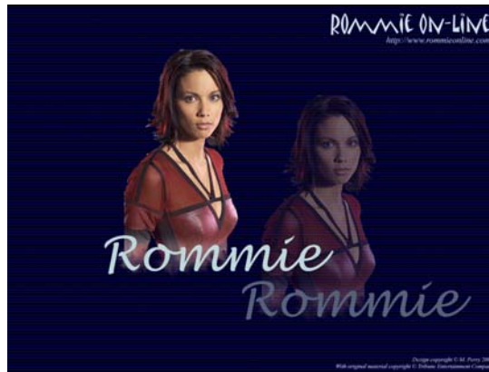
Now that's definitely not Mitt!