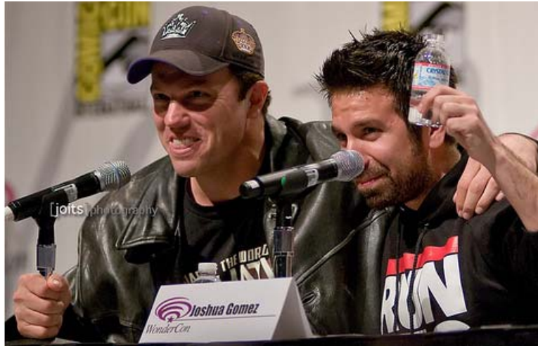
Well, the caption on the site said "Casey & Morgan"

Best Guest star - Single Show: Alex Kingston (DW) - "Hello Sweetie!" River