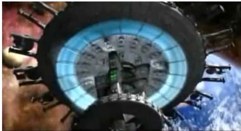
Florescent Lights in Space?

the folks at Hidden Frontier for addressing a current issue via the Star Trek universe. It reminded me how "relevant" the series initially was and